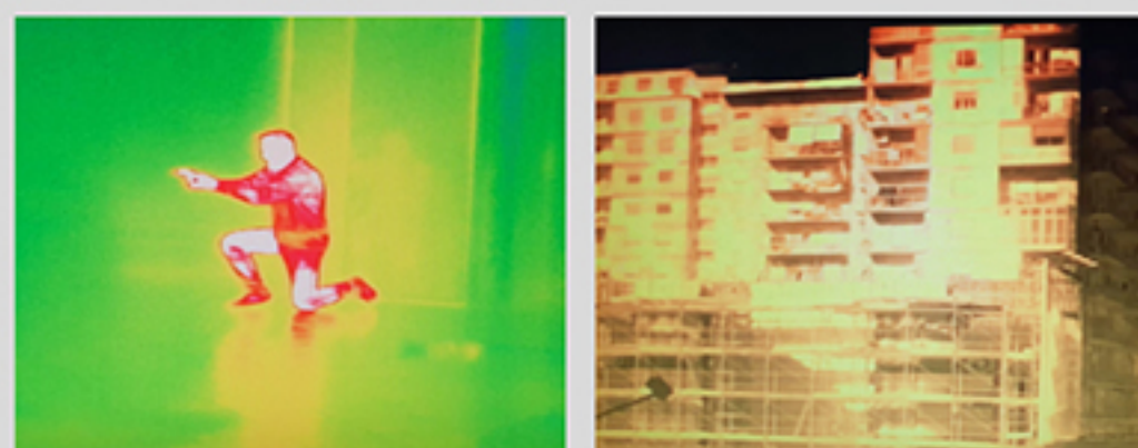
Human Body Detect